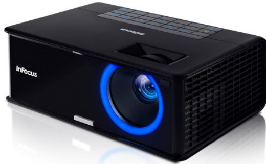
Sample Photo / Actual Multi-Media Player Style May Vary.